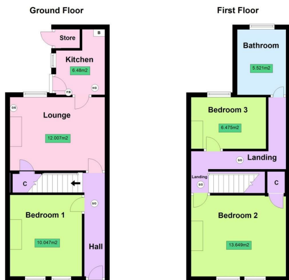
8 Lymore Gardens, Bath